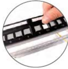
8. Automatically-rebound dust-proof shutter