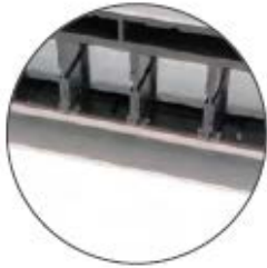
1. Grounding bar for automatic grounding