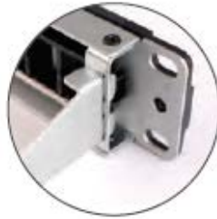
2. Special metal surface treatment, and directly grounded with the cabinet rails