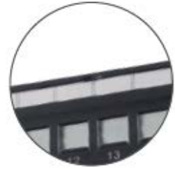
6. Clear marking label