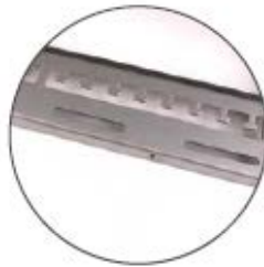
5. Horizontal cable holder for cable management