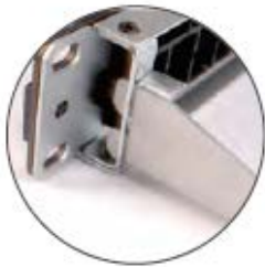
4. Reliable and removable rear cable manager