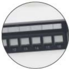
7. Clear and indelible port numbers