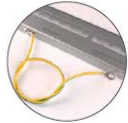
3. Grounding wire